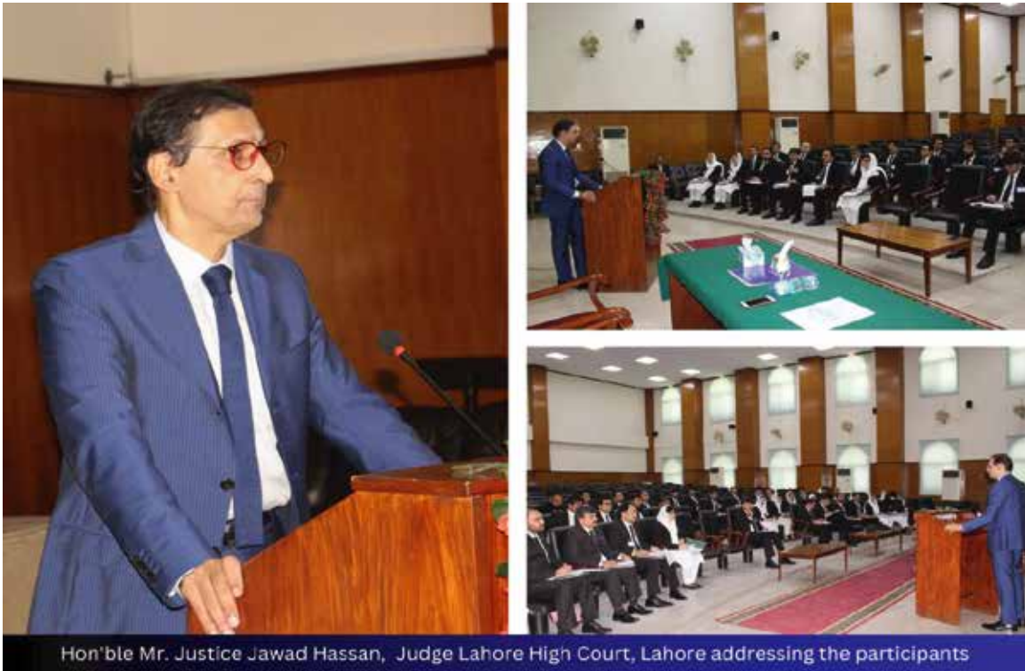
Hon'ble Mr. Justice Jawad Hassan, Judge Lahore High Court, Lahore addressing the participants

During the fifth week of the training, Hon'ble Mr. Justice Jawad Hassan , Judge, Lahore High Court, Lahore, delivered a lecture on "Limine Control in Civil Cases" to the participants of undergoing Pre-Service Training Program. His lordship shared his experiences and emphasized the need for expeditious case disposal under the law, through the application of the doctrine of Limine Control.