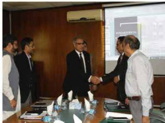
Snapshots of 37 th Meeting of the Board of Management, Punjab Judicial Academy