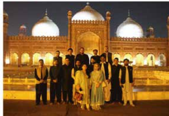
Snapshots of Visit to Historical Places (Lahore Fort & Badshahi Masjid) of newly appointed Judges