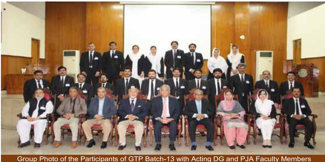
Group Photo of the Participants of GTP Batch-13 with Acting DG and PJA Faculty Members