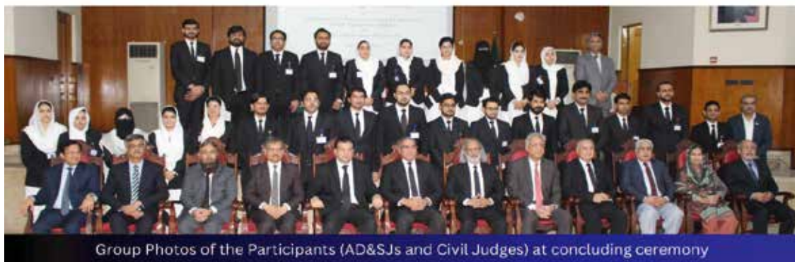
Group Photos of the Participants (AD&SJs and Civil Judges) at concluding ceremony