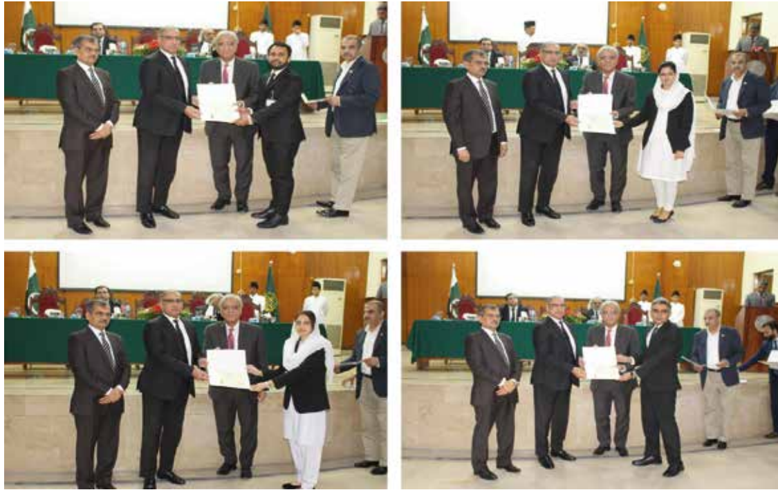
Participants receiving Certificates on completion of Training

The ceremony followed by a group photo of the participants with the Hon'ble Chief Justice and faculty members of PJA.