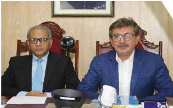
Hon'ble Mr. Justice Shahid Jamil Khan and Tariq Iftikhar Ahmad

The Punjab Judicial Academy successfully conducted a Questions & Answers session through Webinar on 8 th of July, 2023. The objectives of this session were to enhance the knowledge and capacity of the participants regarding assumption of jurisdiction, and to discuss and elaborate judgment reported as 2019 MLD 2095 Lahore titled Sheraz Pervaiz Mustafa versus The Special Judge (Rent) Lahore and others. The program had a specific focus on Rent Tribunals and Rent Appellate Courts in Punjab.