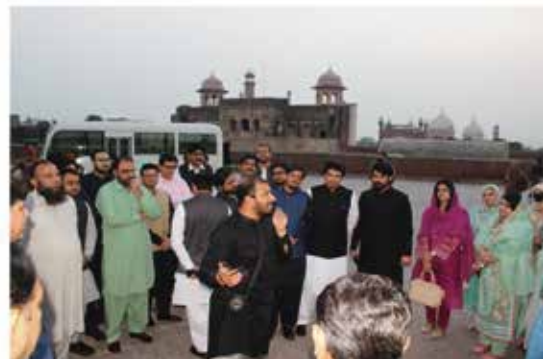
Snapshots of Visit to Historical Places (Lahore Fort & Badshahi Masjid) of newly appointed Judges