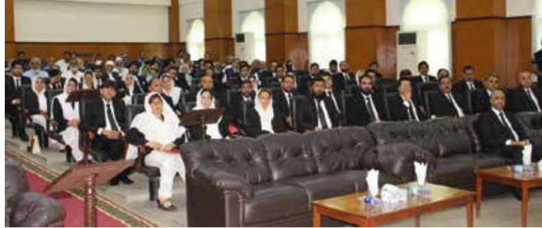
Participants, newly appointed Additional District & Sessions Judges Civil Judges

justice and integrity. He provided a detailed overview of the training program, highlighting its focus on improvement of professional skills, inculcating judicial ethics and promoting exemplary conduct both within and outside the courtroom. He highlighted the Academy's commitment to an interactive training approach, containing