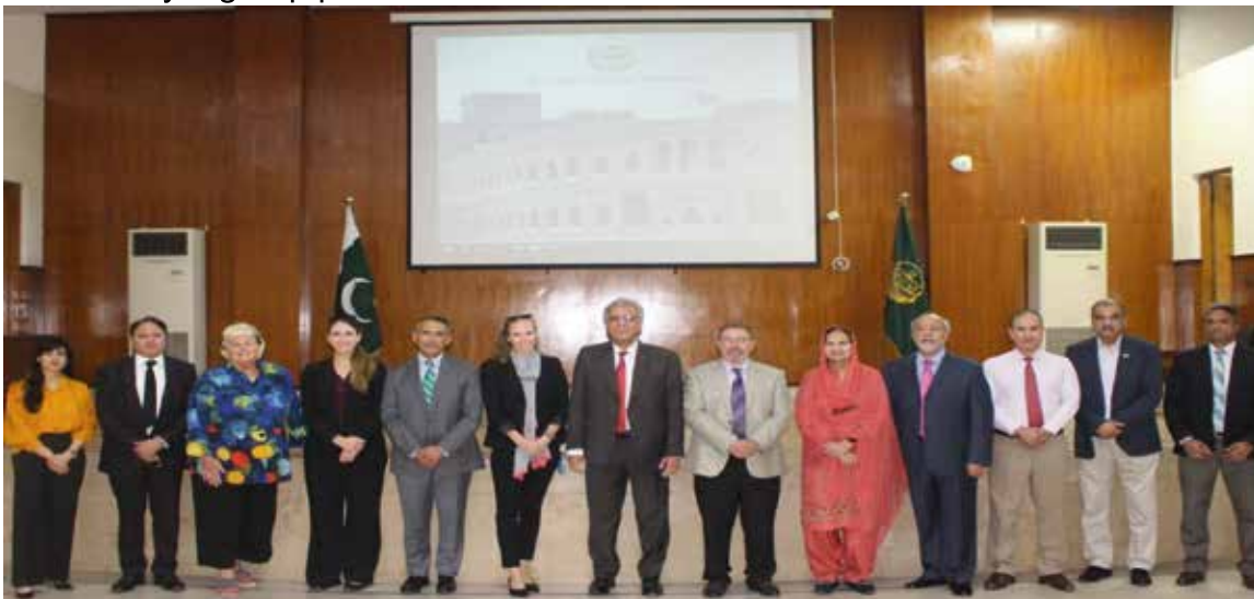
Group Photo of the delegation from the National Centre for State Courts (NCSC) and CODE Pakistan with Acting DG, PJA and Directors/Faculty Members of PJA

interest were discussed. It was mutually agreed that the NCSC, CODE Pakistan and PJA would cooperate to pave the way for future collaborations. At the conclusion of the meeting, the delegation visited the PJA Academy premises, followed by a group photo.