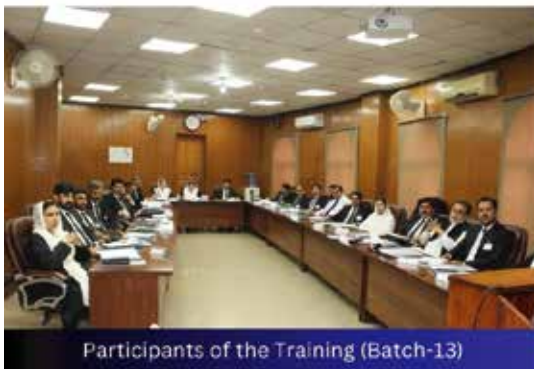
Participants of the Training (Batch-13)