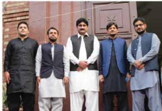
Snapshots of Visit to Historical Places (Lahore Fort & Badshahi Masjid) of newly appointed Judges