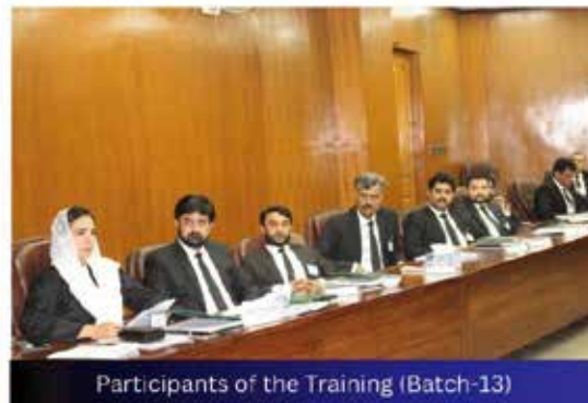
Participants of the Training (Batch-13)