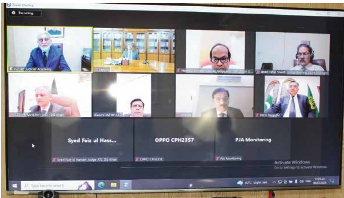
Participants attending Webinars