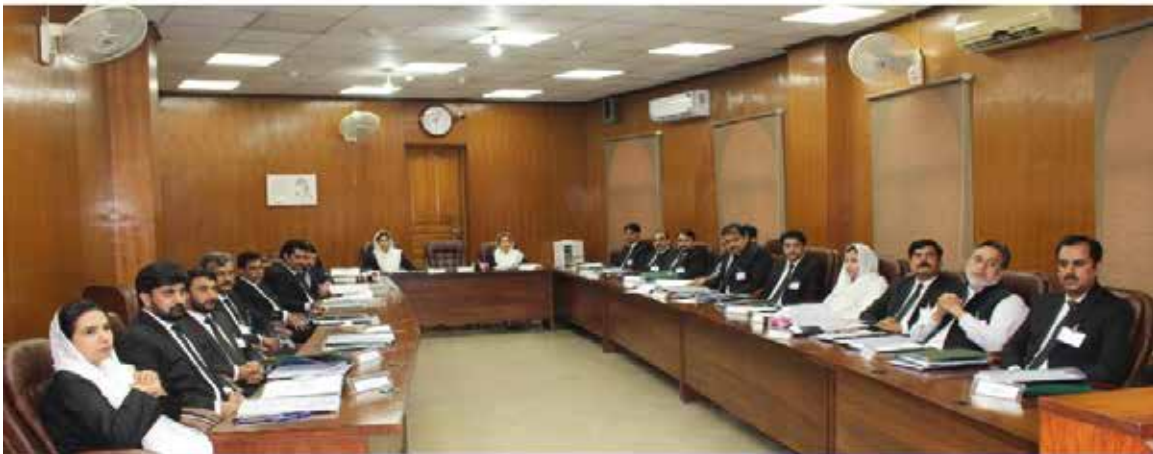
Participants (Batch-13) of the training attending opening ceremony