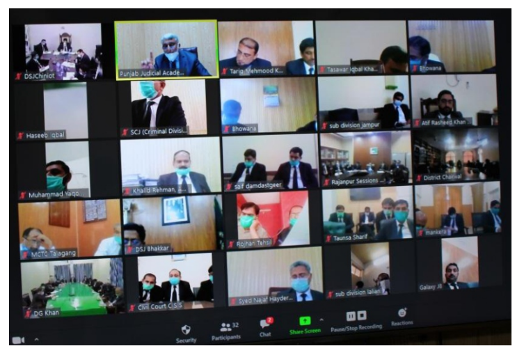
Online Training through Webinar during Covid-19

webinar were also scheduled by the Academy which are running successfully.