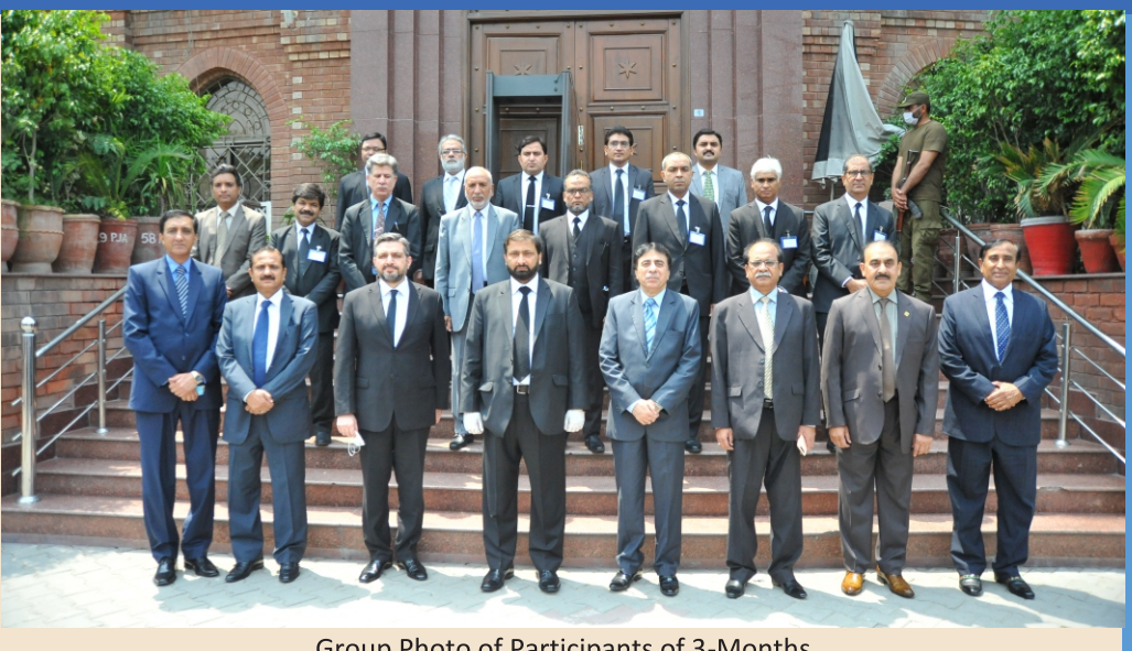
Group Photo of Participants of 3-Months Pre-Service Training of newly inducted 08-AD&SJs