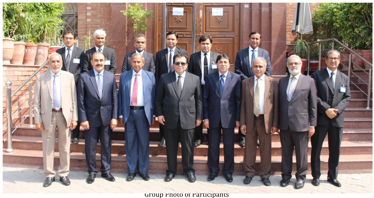
(AD&SJs) of Pre-Service Training with the Faculty of PJA

Visits to King Edward Medical University, Punjab Forensic Science Agency and Mental Health Hospital Lahore were also arranged for under training judges, where they were provided the chance to view post-mortem directly and the use of latest technology to examine physical evidence from an object.