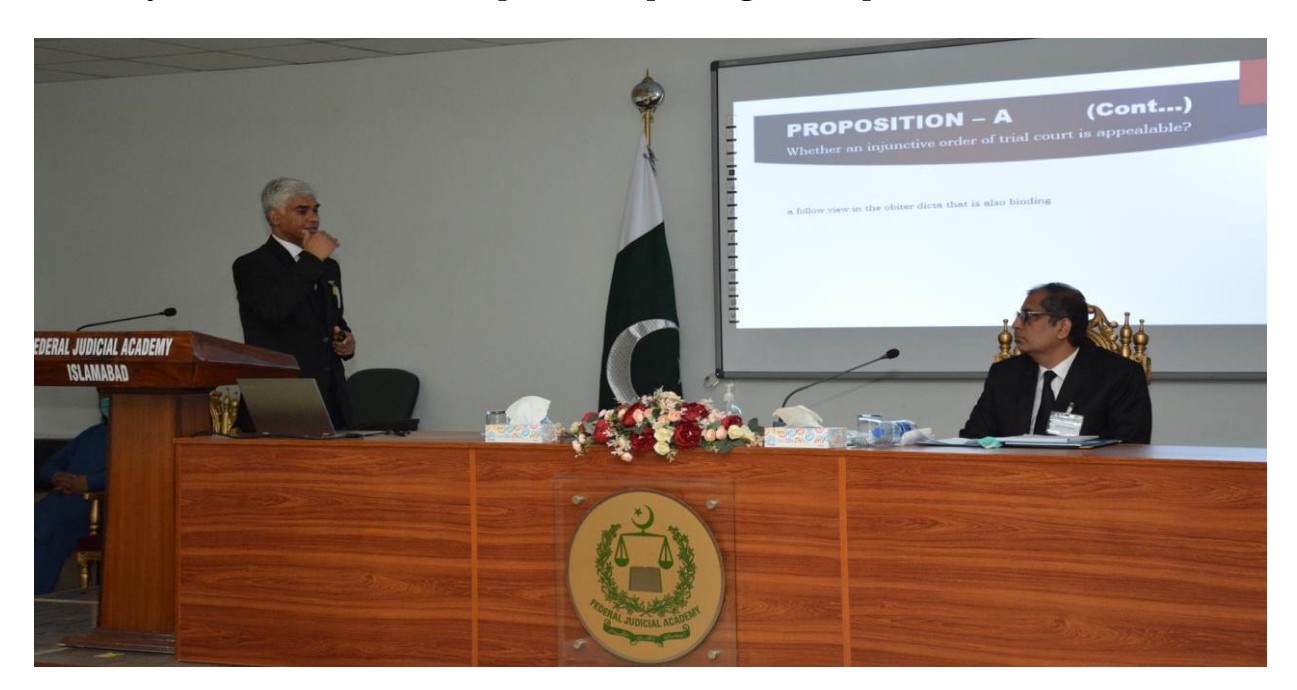
Participants during Mock Trial at Federal Judicial Academy Islamabad

One-week Training for participants was also arranged at Federal Judicial Academy, Islamabad on the topic of "Exploring Concepts in Trial Procedures".