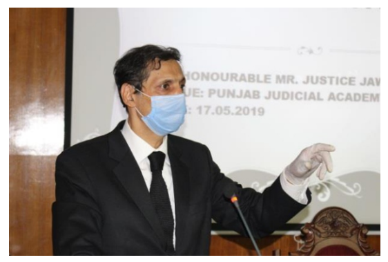
Hon'ble Mr. Justice Jawad Hassan, Judge LHC addressing the participants