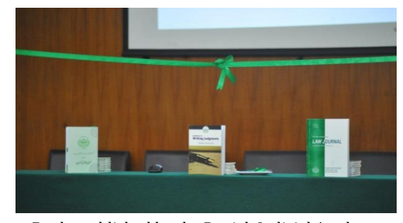
Books published by the Punjab Judicial Academy