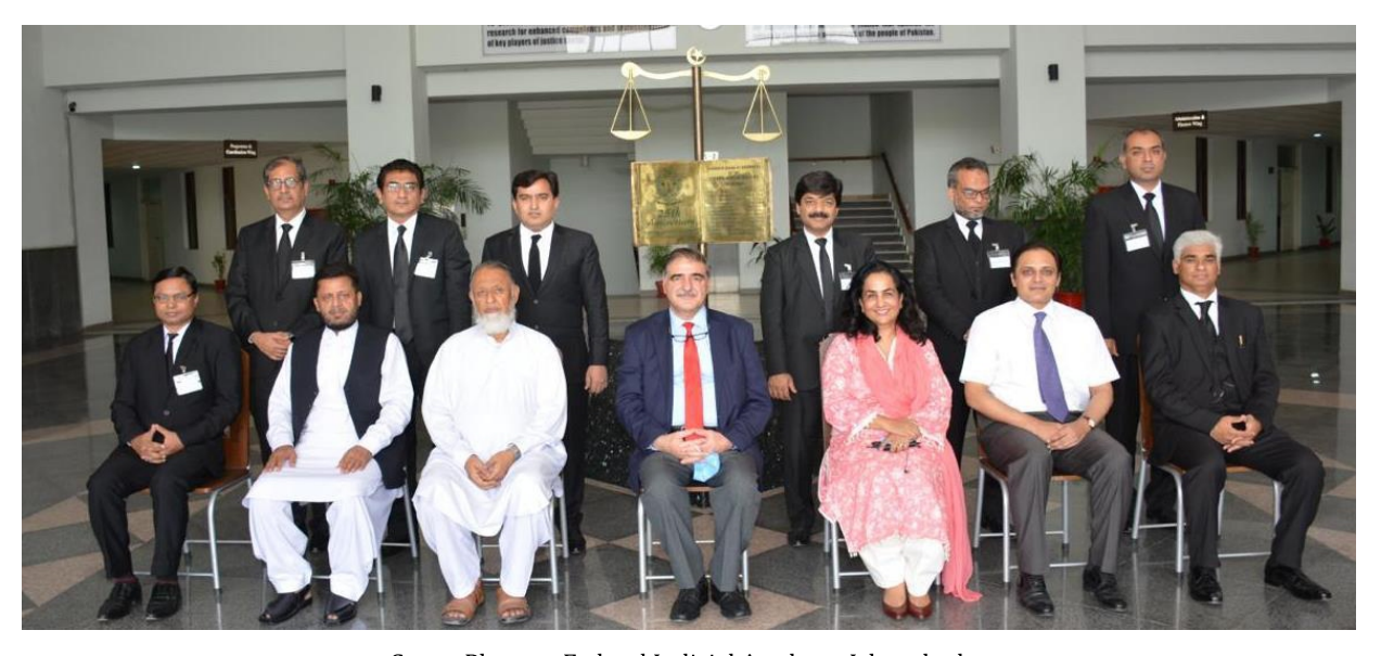
Group Photo at Federal Judicial Academy Islamabad

The participants were also provided an opportunity to visit the Hon'ble Lahore High Court, Lahore and field attachments in District Courts, Lahore to have a grasp on working of Courts.