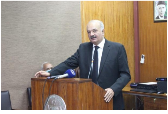
Hon'ble Mr. Justice Shehram Sarwar Ch. addressing the Participants (Anti-Corruption Court Judges)