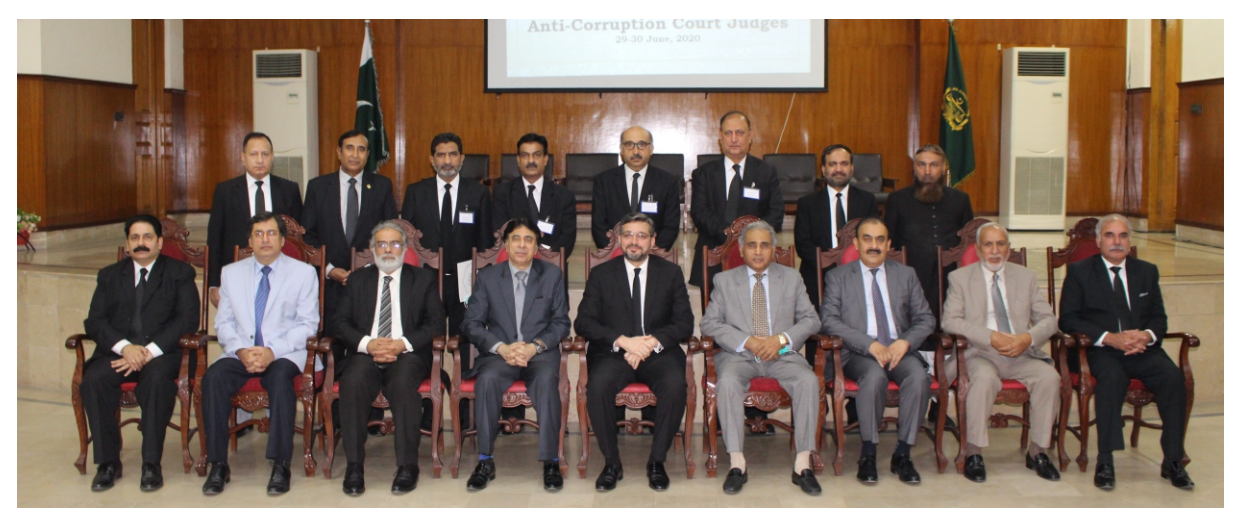
Group Photo of the Participants of two day Workshop for Anti-Corruption Court Judges