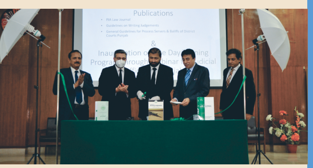
Launching Ceremony of PJA Publications