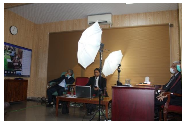
Webinar Room of the Academy