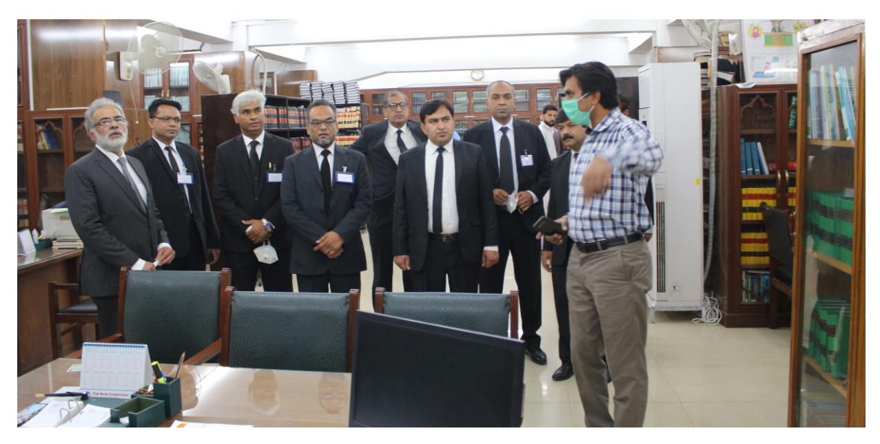
Participants (AD&SJs) of Pre-Service Training visiting the Library of Lahore High Court

Visits to King Edward Medical University, Punjab Forensic Science Agency and Mental Health Hospital Lahore were also arranged for under training judges, where they were provided the chance to view post-mortem directly and the use of latest technology to examine physical evidence from an object.